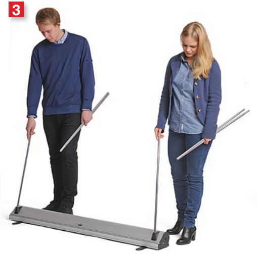
Take two sections of each pole set (start with the untapered) and mount these on each side of the cassette.