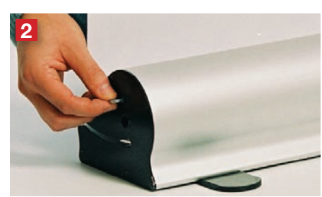
Insert the locking pin.