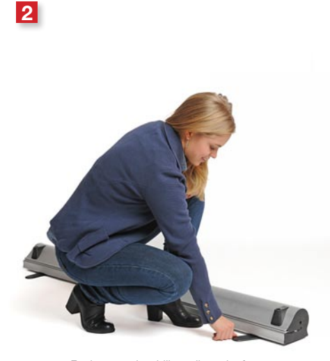
For increased stability pull out the four support legs on the cassette.