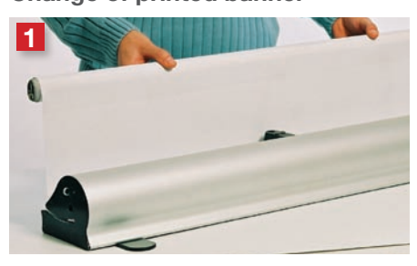
Roll the old banner out of the cassette.