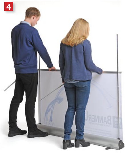
Pull the banner halfway out of the cassette.