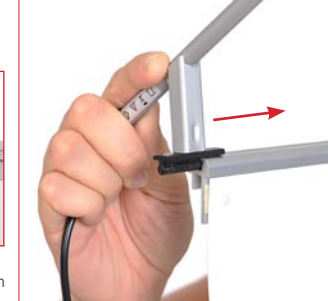
Slide the spotlight along the top rail groove.