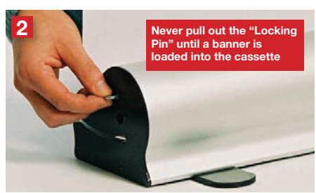
Hold the banner and remove the locking pin.