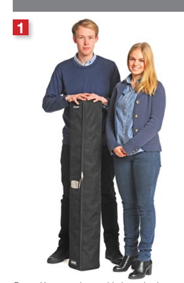
BannerUp comes in a padded carrying bag with shoulder strap.