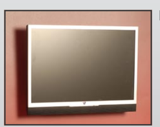
LCD screen holder