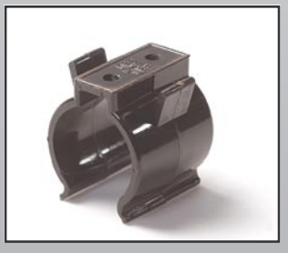
Plastic gripper (for hard panels)