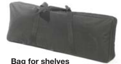
Bag for shelves Item IS-80-TB05