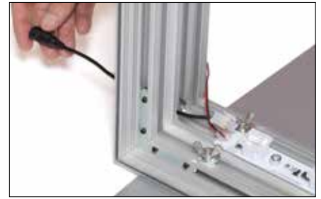
3 Insert the adaptor cable in the hole in the profile. Each hole fits 2 cables.