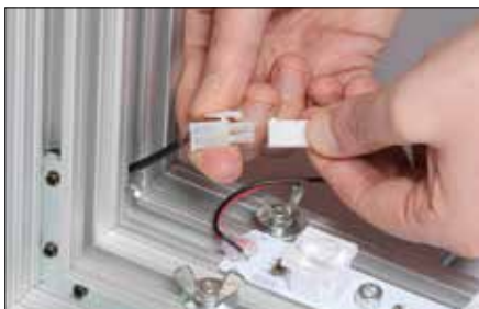
4 Connect the contacts from the LED-bar to the adaptor cable.