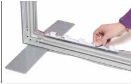
1 Attach the bar with twist nuts into the centre slot in the profile.