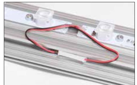
6 Hide the cable in the side slot and secure it with a tape.