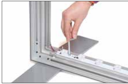
2 Lock the two screws with the Allen-key.