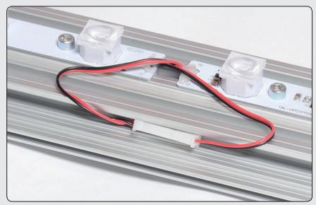
6Hide the cable in the side slot and secure it with a tape .