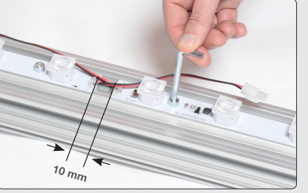
5 Add more LED-bars and connect with that before, approx 10 mm from the first one.