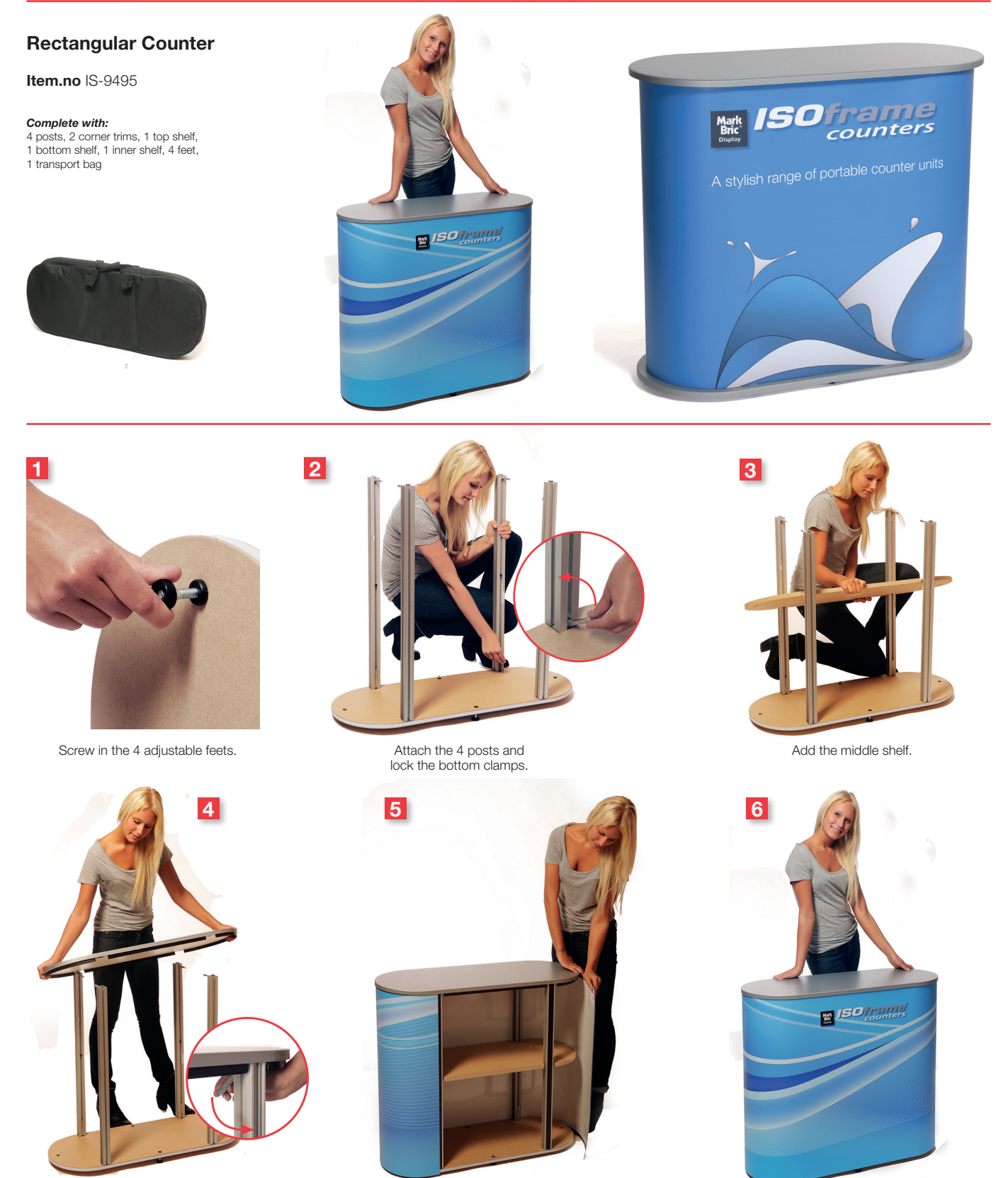
Attach the table top and lock the top clamps