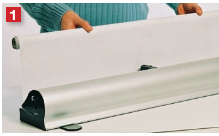
Roll the old banner out of the cassette.