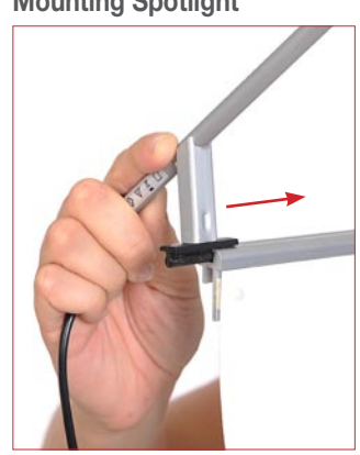
Slide the spotlight along the top rail groove.