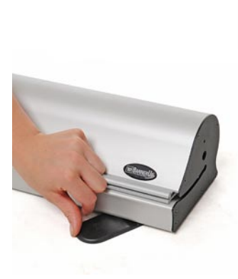
For increased stability pull out the four support legs on the cassette.