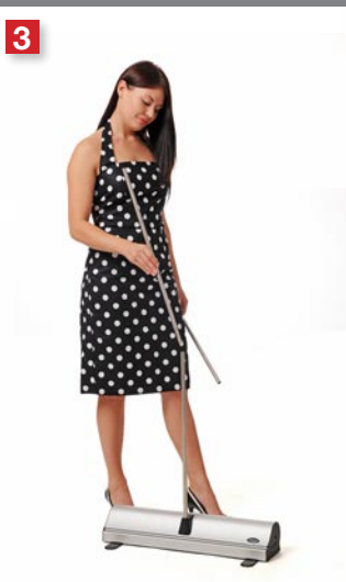
Take two of the pole sections (start with the untapered) and mount these on the cassette.