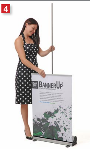
Pull the banner halfway out of the cassette.