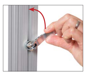
3 Twist the handle 90°