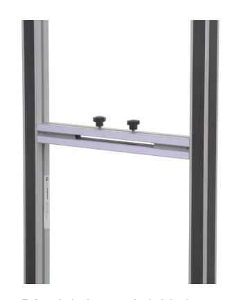
Attach the beam at the height that you want the shelf.