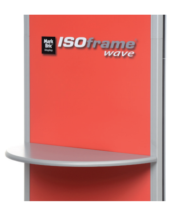
Push the shelf into the slot