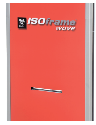
Mount the graphic panel and adjust the beam to match the slot that you have made in the panel.