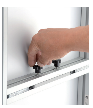
Lock the shelf with the two screws at the reverse side.