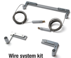
Wire system kit Item Midi IS-9312 / Maxi IS-9312