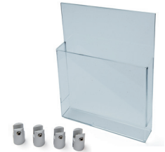
Literature holder Item IS-9318