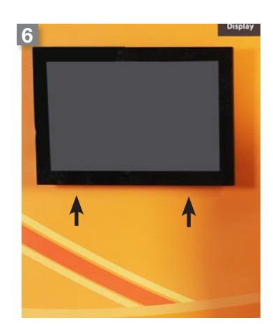
Lock the LCD with the two screews in the bottom of the screen rails!