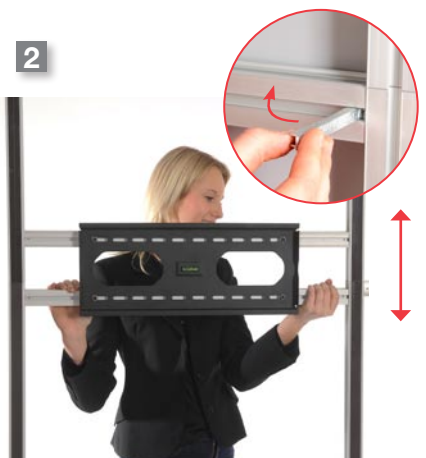
Attach the LCD holder in the system with the 4 FASTclamp locks.