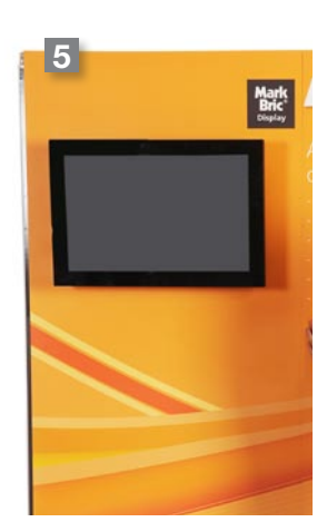
Hook on the LCD