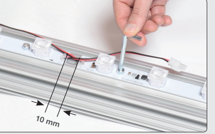
5 Add more LED-bars and connect with that before, approx 10 mm from the first one.