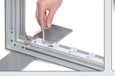
2 Lock the two screws with the Allen-key.

Attach the bar with twist nuts into the centre slot in the profile.