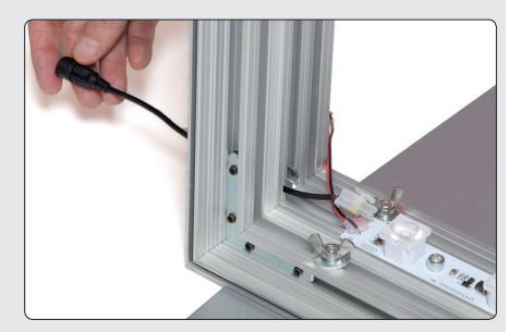
3 Insert the adaptor cable in the hole in the profile. Each hole fits 2 cables.