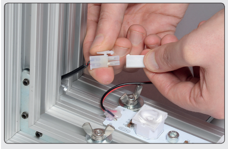
Connect the contacts from the LED-bar to the adaptor cable.