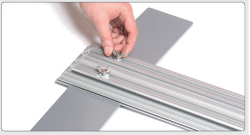
Mount a foot in each side of the bottom profile.

Item no: IS-9338 (Minimum 2 pcs.) The frame must be drilled for the feet on the bottom profile.