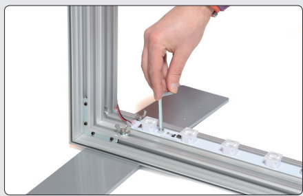
2 Lock the two screws with the Allen-key.