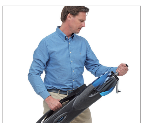
Take out ShowFlex from the bag/case and set it upright on a table.