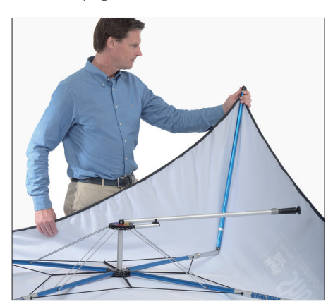
4 Unfold arms and lock springloaded