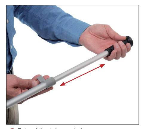
6 Extend the telescopic leg.