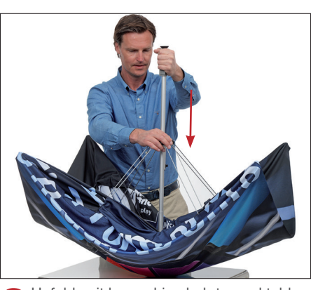
Unfold unit by pushing hub toward table.