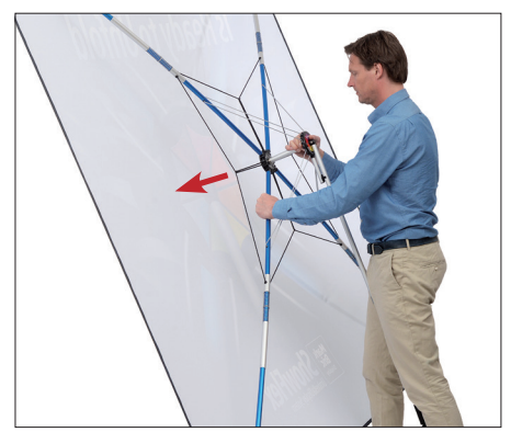
Pull hub away toward from the graphic to stretch the system to complete setup.