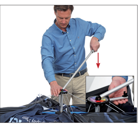
Pivot telescoping leg 90° to lock hub and click in at the locking pin.