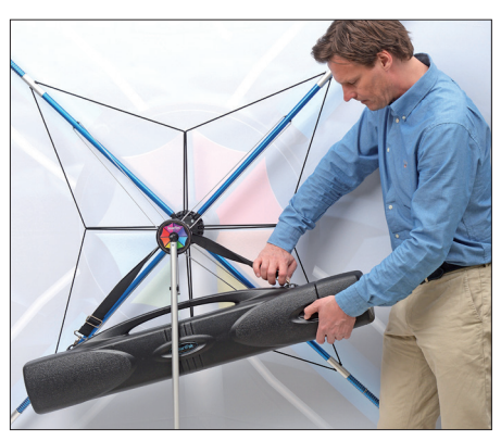
Hang the transport case with the shoulder strap on the back hub to add counterbalance to the display.